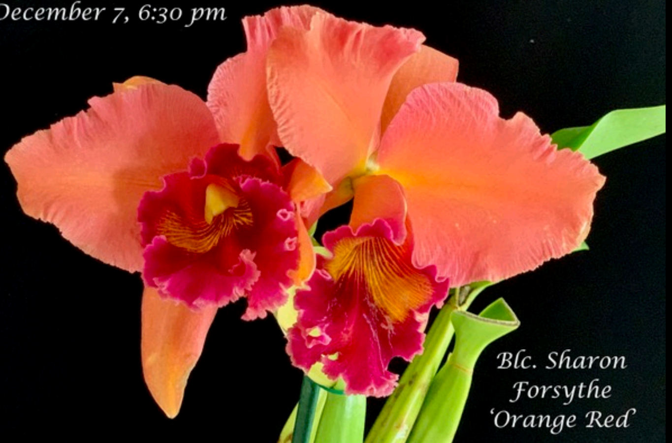
B/c. Sharon Forsythe 'Orange Red'